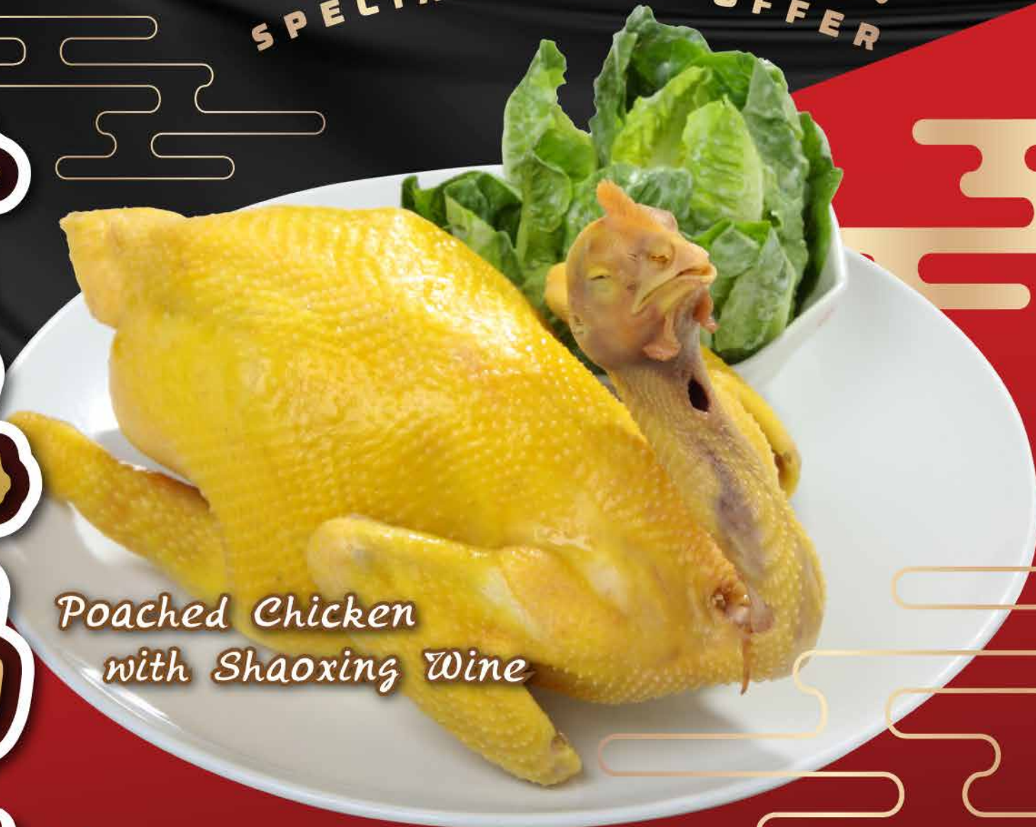
Poached Chicken with Shaoxing Wine

* 图片仅供参考 Image is for illustration purposes only